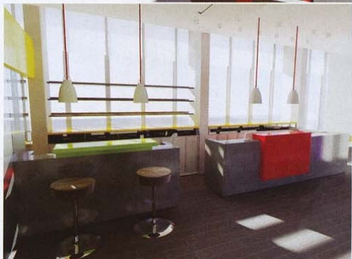
WELSH RUGBY UNION HQ: BBI. SLEEPERZ: CLASH ARCHITECTS